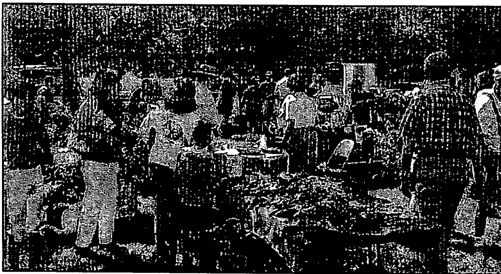
Hundreds of people enjoyed the fair.